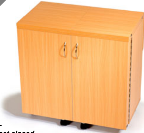
The GEMINI - Super compact closed