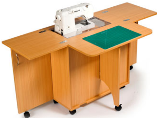
The GEMINI - Fitted with the excellent recessed door design and handy easy up compact back flap